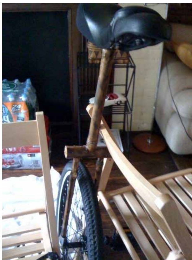
(below) The finished bamboo unicycle.