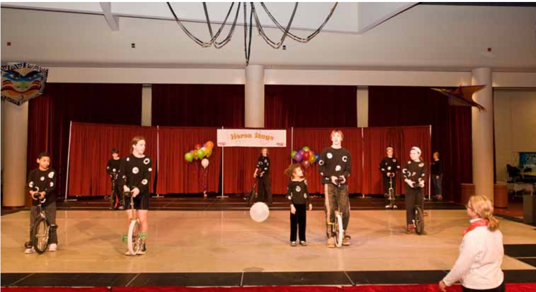
The Madison Unicyclists performing at Celebrating Youth.