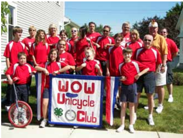
(above) WOW gathers for a photo at the Poultry Parade.

Beginner's practice was a total success, we had about 20 people take lessons and 6 join the club. Some already knew how to ride, which was very impressive.