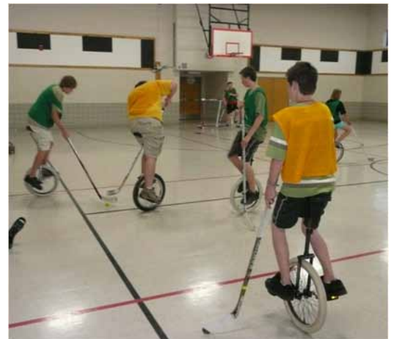
Uni Flu drives seemingly normal unicyclists to chase a tennis ball with sticks.