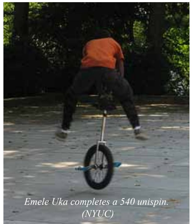
Emele Uka completes a 540 unispin. (NYUC)