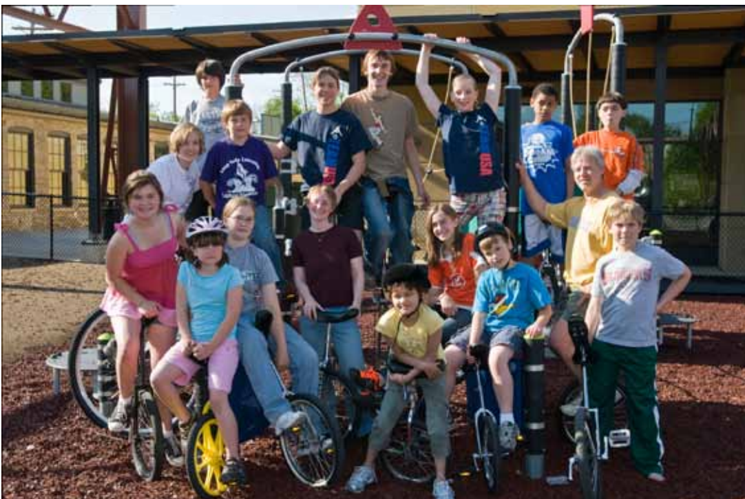
The USA's newest club, the Madison Unicyclists.