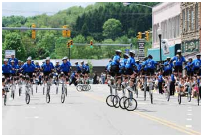
Gym Dandies riders participate in the West Virginia Strawberry Festival 2009.

Each year the Gym Dandies appears in various events around the state and region, as well as national events to include the Macy's Thanksgiving Day Parade 2005 NYC, the National Independence Day Parades 2000, 2004, 2006 in Washington DC, Montreal Cycling Festival 2002, and the Parade of the National Cherry Blossom Festival 2008, Washington DC .