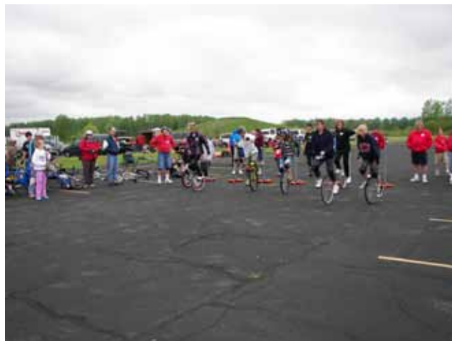
(below) Riders practice their racing at the regional meet in Ohio.