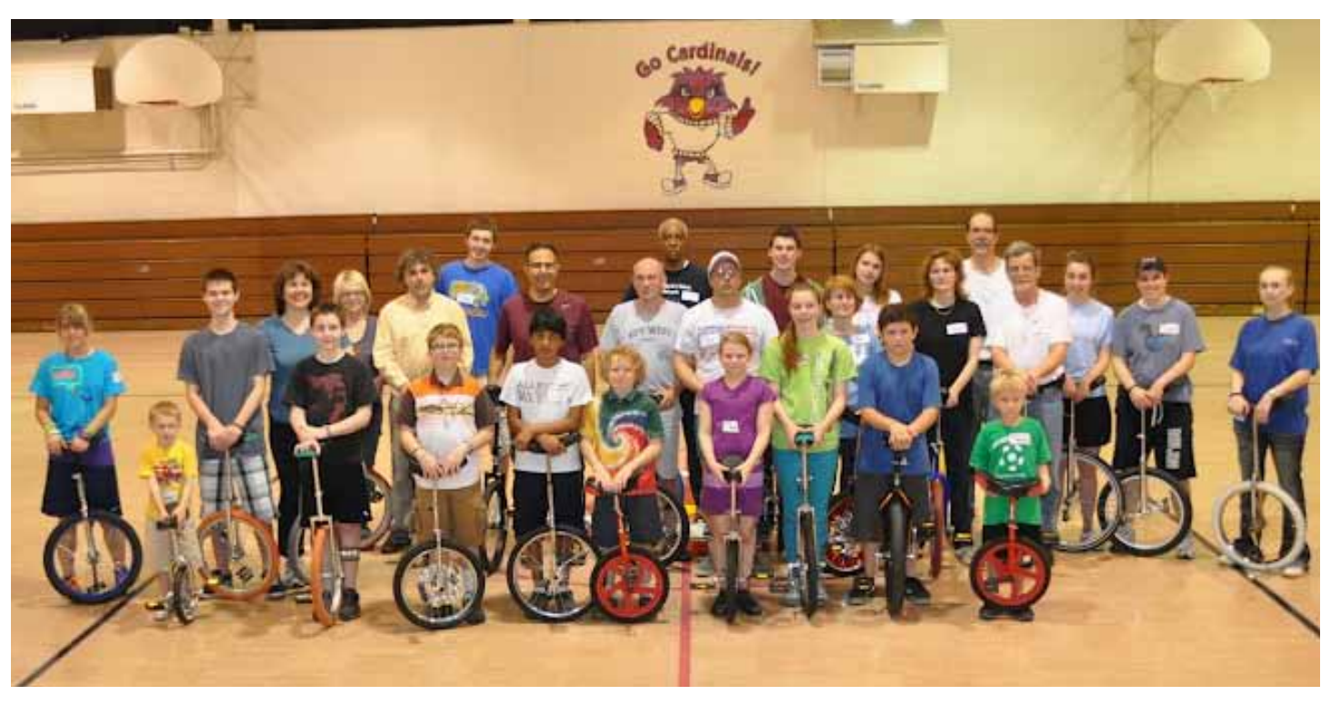
Redford Township Unicycle Club's Graduated Class of 2012. PAGE 4 | A Success Story